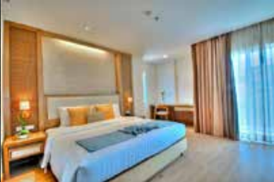
Ashlee Plaza Patong