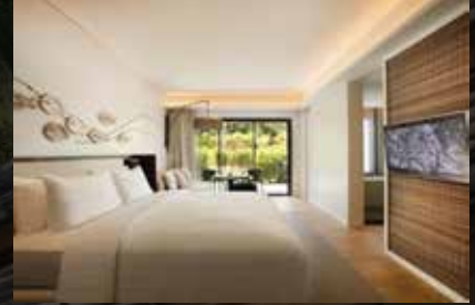
The Shellsea Krabi