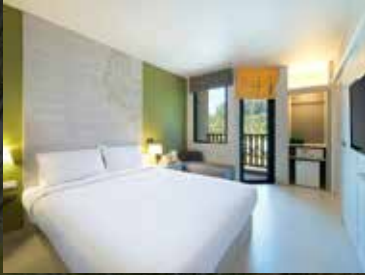
Ibis Stuye Krabi