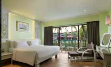
Ao Nang Villa